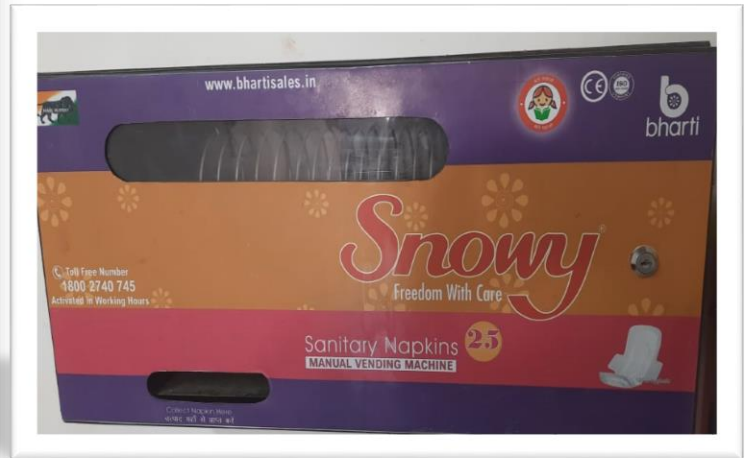
Sanitary Napkin Vending